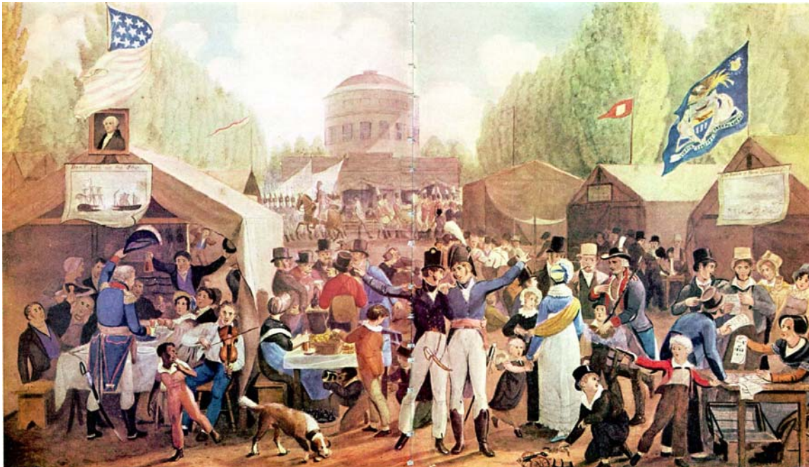
Source: "Fourth of July", Centre Square, Philadelphia (1819), by John Krimmel http://www.pemberley.com/janeinfo/krimlj4b.jpg